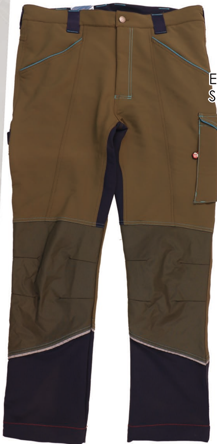
EH060 Stretch Trousers