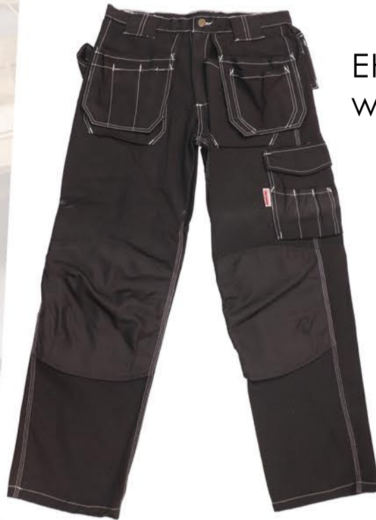
EH044 Multi-pockets workpants with HP