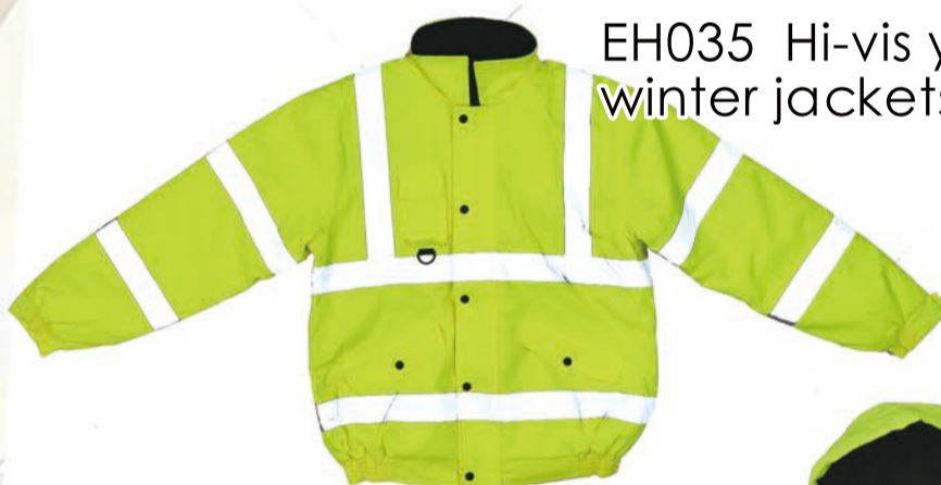
EH035 Hi-vis yellow navy winter jackets with D-ring