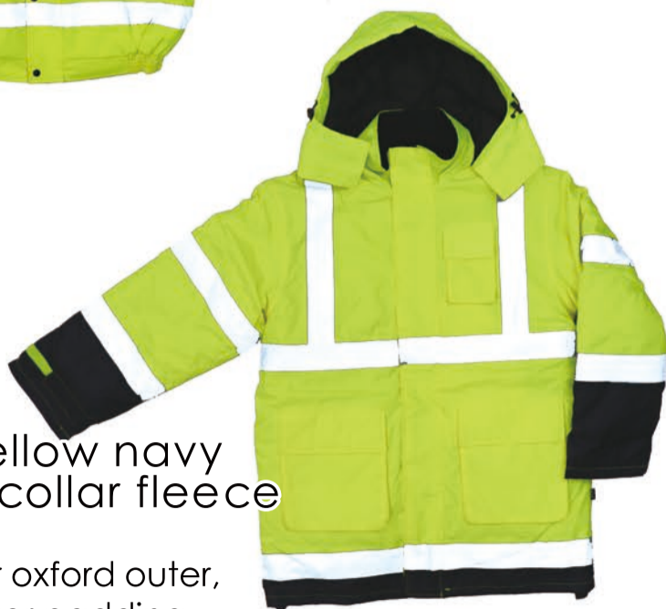
EH036 Hi-vis yellow navy winter jackets collar fleece

PU coated polyester oxford outer, taffeta lining, polyester padding, 3M reflective tape, conform to EN20471 standards