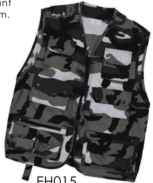
EH015 Camo Vests

65%Polyester/35%Cotton, twill,with crease-resistant finish,weight200-260gsm.