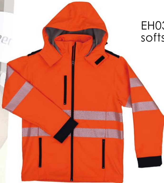
EH038 Hi-vis orange softshell jackets

Innovative and stylish hi-vis softshell jackets, 100% polyester, Water-resistant, Fleece-lined, Full zip with two zipped lower pockets , Tape-reflective material, conform to EN20471 standard