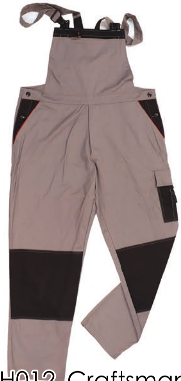
EH012 Craftsman Bibpants