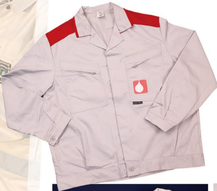
EH002 Painters work jackets

65%Polyester/35%Cotton or 100%Cotton, twill,weight200-260gsm.