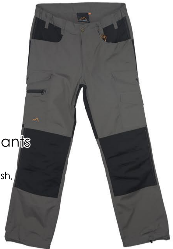
EH008 Outdoor man pants

65%Polyester /35%Cotton or 100%Cotton, twill,weight200-260gsm.