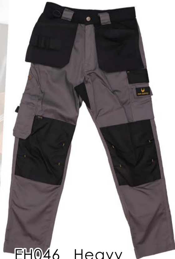
EH045 Multi-pockets workshorts

100% Cotton twill, heavy weight 360gsm, with Cordura knee patch, triple stitching.