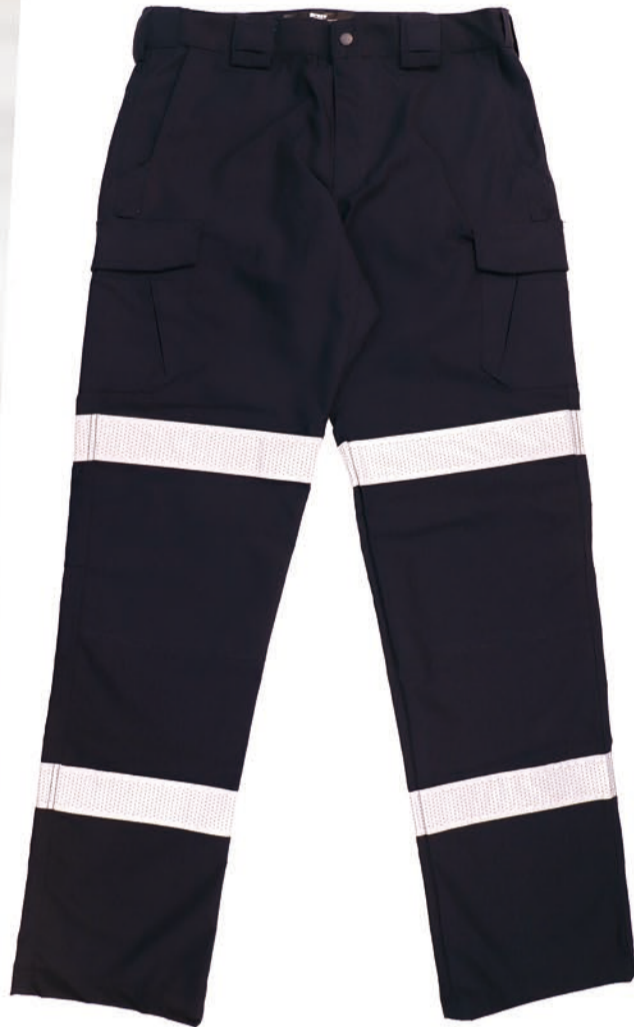
EH062 Military trousers with high-visibility reflective strip