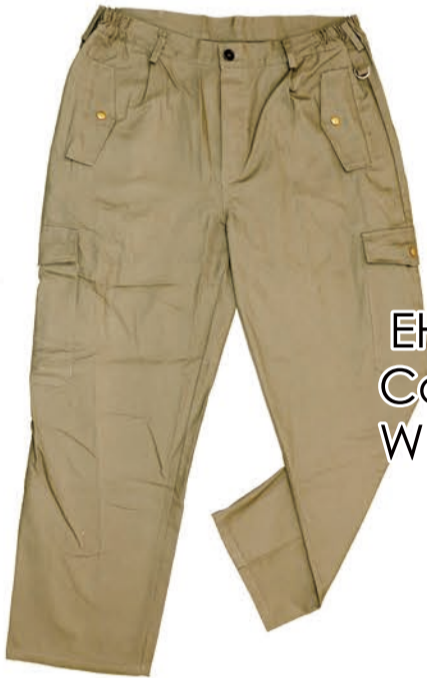
EH013 Cavans Olive Work Pants

65%Polyester/35%Cotton, twill,with crease-resistant finish,weight200-260gsm.