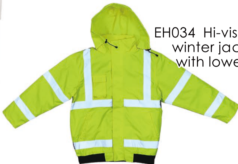
EH034 Hi-vis yellow winter jackets with lower rib