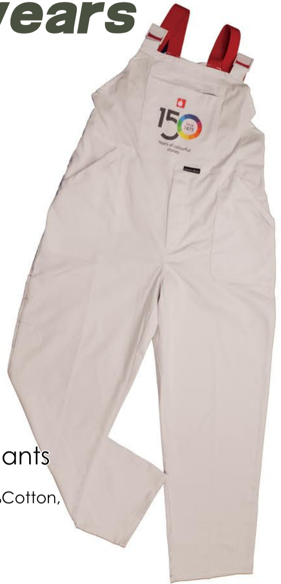
EH001 Painter' s Bibpants

65%Polyester/35%Cotton or 100%Cotton, twill,weight200-260gsm.