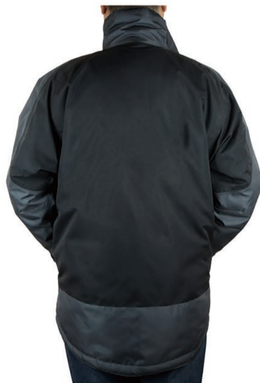
EH019 Winter jackets

100%Polyester, 320T tason, PU white coating; 300D oxford PU double transparent coating, 210T taffeta lining, and 100%polyester padding.