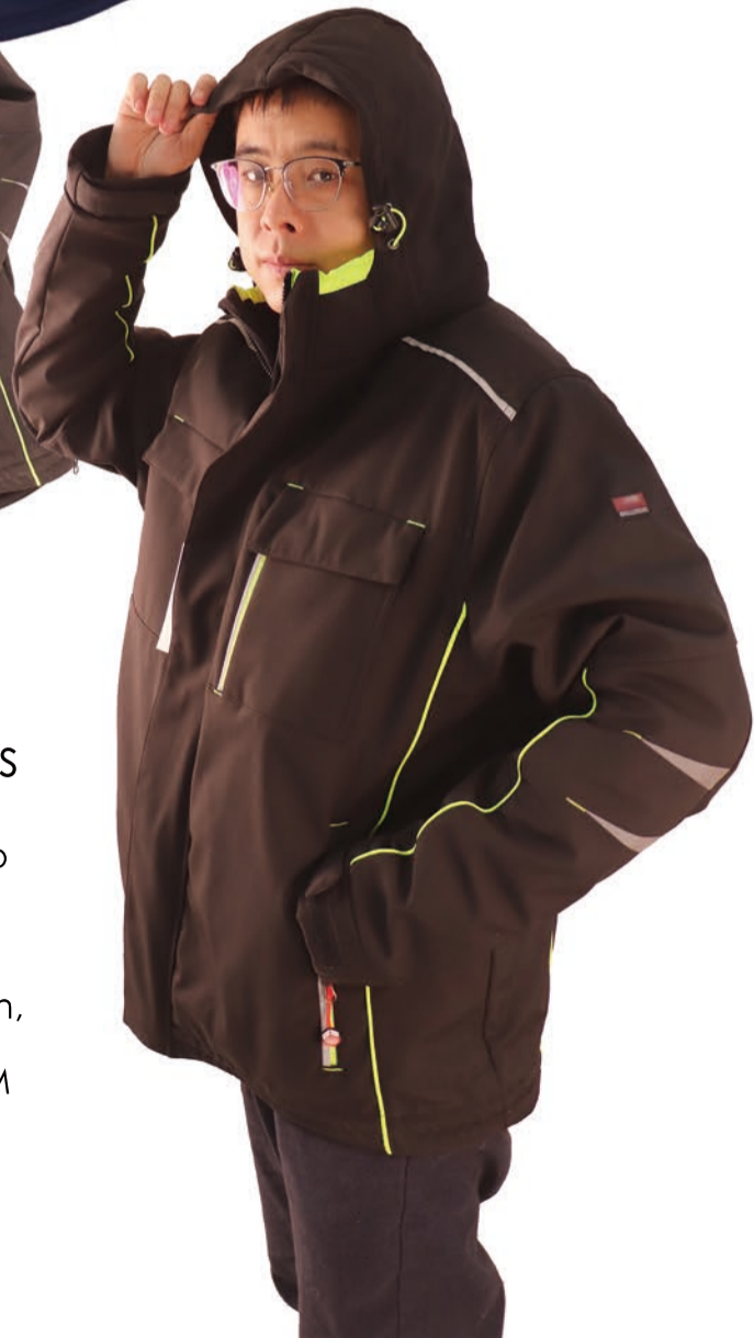
EH023-Thermo softshell jackets

Vislon main zipper up to collar top; detachable hood by Nylon zipper, fleece lining. 94%polyester/6%elastan, 300gsm, plain Softshell, W/R8000MM/M PV3000