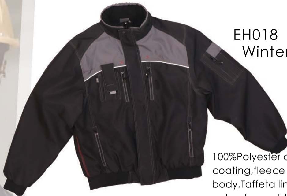
EH018 Winter Jackets

100%Polyester oxford with PU coating, fleece lining in main body, Taffeta lining and polyester padding in sleeve.