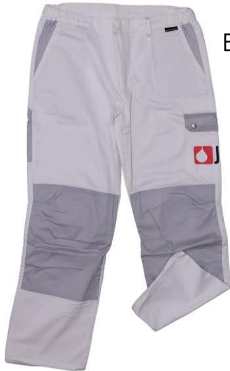
EH003 Painters Workpants

65%Polyester /35%Cotton or 100%Cotton, twill,weight200-260gsm.