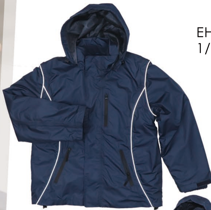
EH026 1/4 Driver Parka

100%Polyester, Micro fibre plain, PU Coating WR8000/MPV5000, inner jackets with Polar fleece, TAFFETA lining.