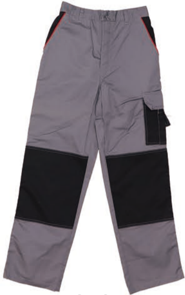
EH010 Craftsman Trousers