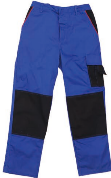
EH011 Craftsman Trousers