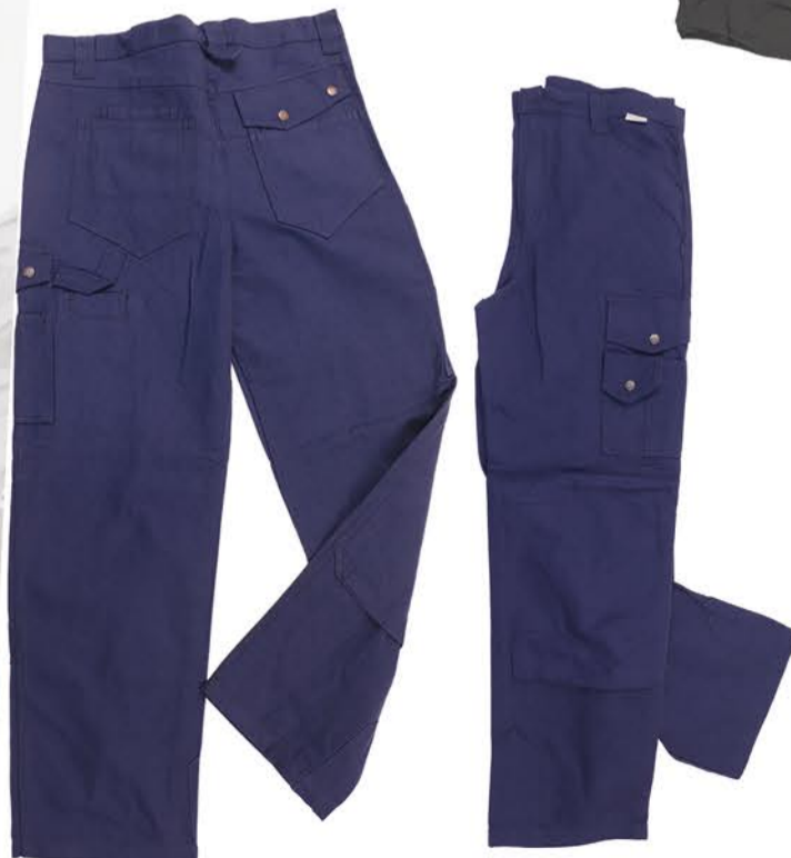
EH009 Cavans Navy Work Pants

65%Polyester/35%Cotton, poplin,durable water-repellent finish, weight 230gsm.