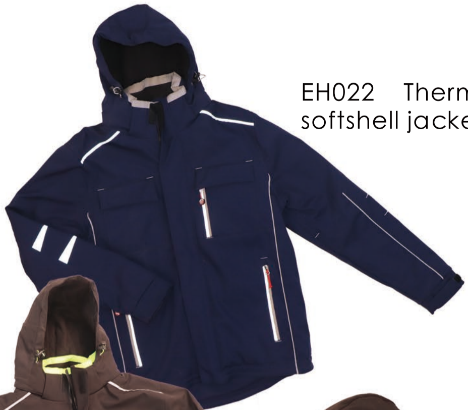
EH022 Thermo softshell jackets