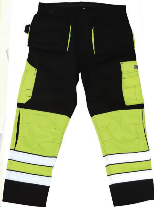
EH039 Heavy Hi-vis yellowblack workpants

Innovative and stylish hi-vis softshell jackets, 100% polyester, Water-resistant, Fleece-lined, Full zip with two zipped lower pockets , Tape-reflective material, conform to EN20471 standard